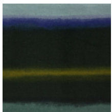
0577-01 ESTEREL - MEDITERRANÉE