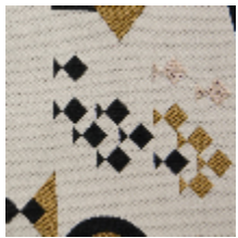
0578-01 REGATE - FLAMANT