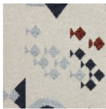
0578-03 REGATE - NAUTIQUE