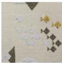
0578-02 REGATE - ZENITH