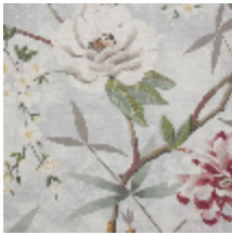
0583-02 PRINTEMPS DE CHINE - AQUA *