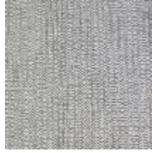
0605-04 PALISSE - CORDE *