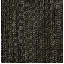
0605-01 PALISSE - FAISAN *