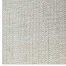
0605-03 PALISSE - AVOINE *