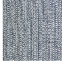
0605-05 PALISSE - HERON *