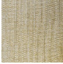
0605-02 PALISSE - CHAUME *