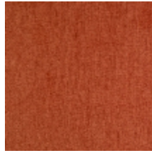
0616-34 SMART - TERRACOTTA