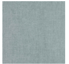
0616-42 SMART - CIEL