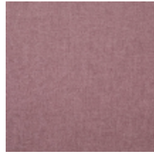
0616-35 SMART - PETALE