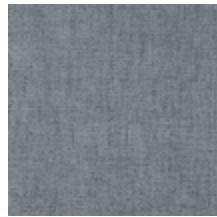
0616-41 SMART - BLEU ACIER