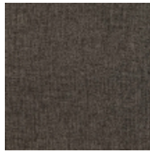
0616-40 SMART - ARDOISE