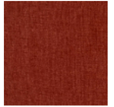
0616-36 SMART - CORNALINE