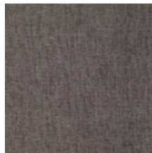
0616-46 SMART - TAUPE