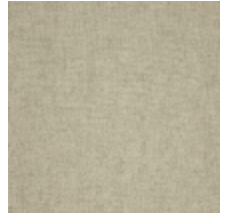
0616-30 SMART - VERVEINE