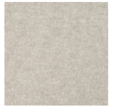
0616-24 SMART - FICELLE