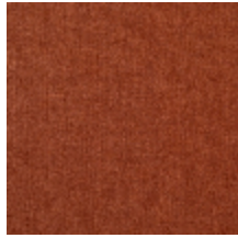
0616-33 SMART - ALEZAN