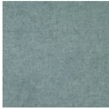
0616-31 SMART - JADE