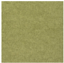
0616-19 SMART - PRAIRIE