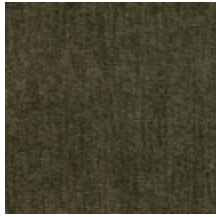
0616-32 SMART - KAKI