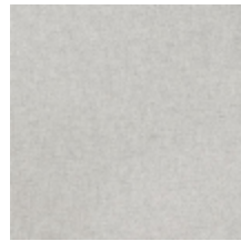
0616-23 SMART - PERLE