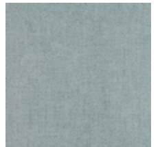
0616-42 SMART - CIEL