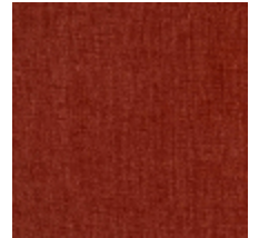
0616-36 SMART - CORNALINE