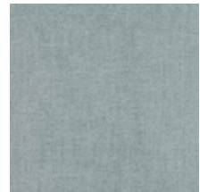
0616-42 SMART - CIEL