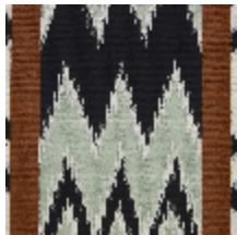
0629-01 EVEREST - ECAILLE