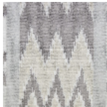
0629-03 EVEREST - ARGENT