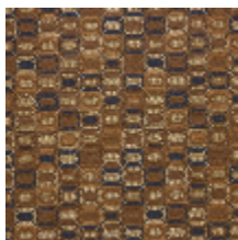
0630-01 KHAN - MORDORE