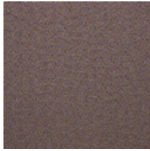
0631-08 RITUEL - AMETHYSTE