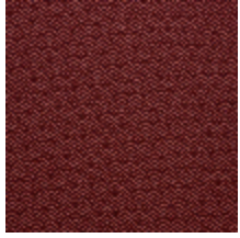
0631-01 RITUEL - TOMETTE