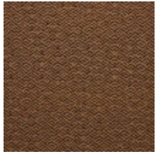
0631-07 RITUEL - COGNAC