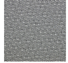
0631-06 RITUEL - ARDOISE