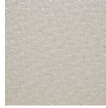
0631-04 RITUEL - NATUREL