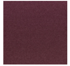
0633-06 WOOLY - FIGUE