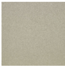
0633-20 WOOLY - FICELLE