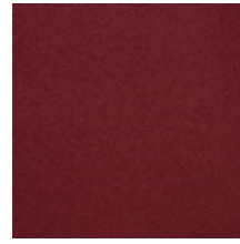
0633-05 WOOLY - RUBIS