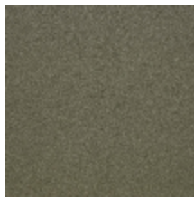
0633-21 WOOLY - TAUPE