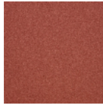
0633-04 WOOLY - SANGUINE