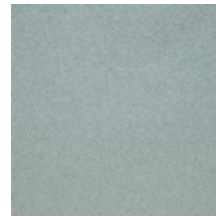
0633-11 WOOLY - CELADON