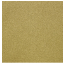
0633-03 WOOLY - TILLEUL