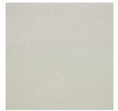
0633-18 WOOLY - DUNE