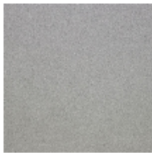
0633-14 WOOLY - SOURIS