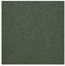
0633-01 WOOLY - FORET