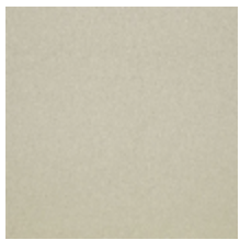
0633-19 WOOLY - SABLE