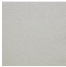
0633-15 WOOLY - GALET