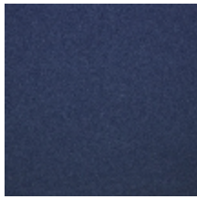
0633-08 WOOLY - MARINE