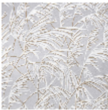
0637-02 GRAMINAE - GRIS