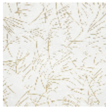
0637-03 GRAMINAE - BLANC