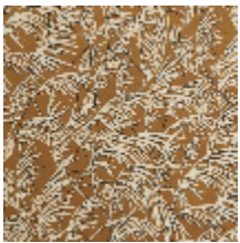
0637-01 GRAMINAE - GAZELLE