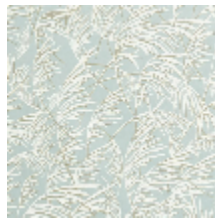
0637-04 GRAMINAE - CELADON