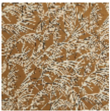
0637-01 GRAMINAE - GAZELLE