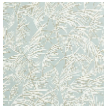
0637-04 GRAMINAE - CELADON