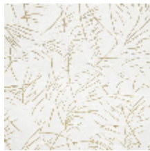
0637-03 GRAMINAE - BLANC