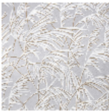
0637-02 GRAMINAE - GRIS