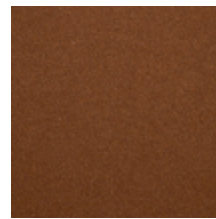
0638-23 TAÏGA - SAFRAN