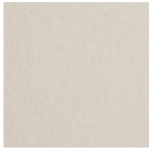
0638-02 TAÏGA - ECRU