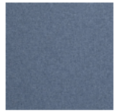
0638-18 TAÏGA - AZUR