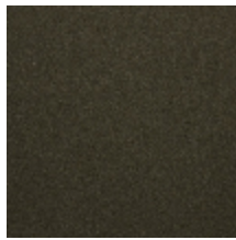
0638-15 TAÏGA - KAKI