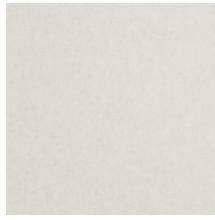
0638-03 TAÏGA - NEIGE