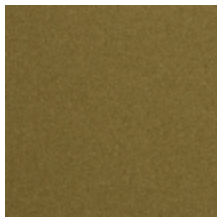
0638-13 TAÏGA - ANIS