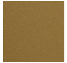
0638-12 TAÏGA - BLÉ