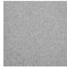
0638-05 TAÏGA - BRUME