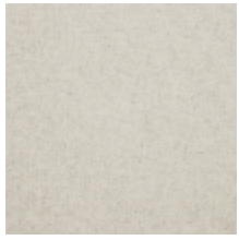
0638-01 TAÏGA - NATUREL