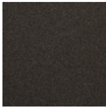
0638-08 TAÏGA - VISON