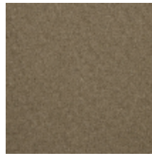
0638-10 TAÏGA - CHAMOIS