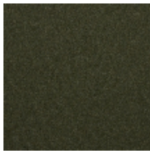
0638-14 TAÏGA - FORÊT