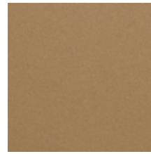
0638-11 TAÏGA - CAMEL