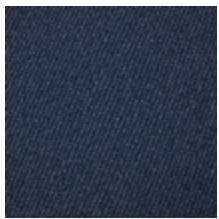
0638-19 TAÏGA - DENIM