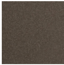
0638-09 TAÏGA - OURS