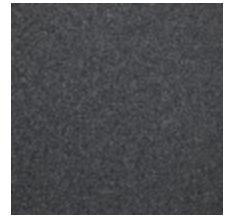
0638-06 TAÏGA - CHARTREUX