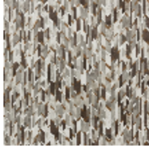
6445-02 MARQUETERIE BOIS *