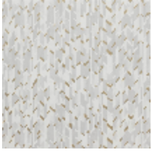
6445-01 MARQUETERIE MARBRE *