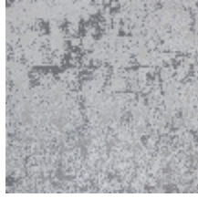
6447-03 PATINE ARGENT