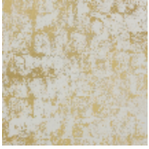
6447-01 PATINE VERMEIL