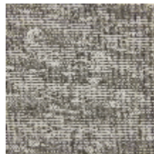
6458-03 ONDULATION - FUMÉE