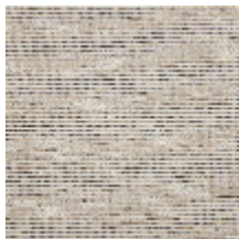
6458-01 ONDULATION - GREGE