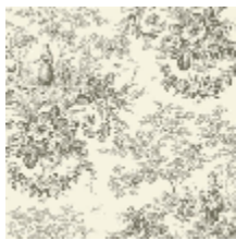
6491-01 BEAUX JOURS - CENDRE