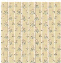
6497-01 MADemoiselle - PAILLE