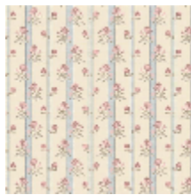
6497-03 MADemoiselle - PORCELAINE