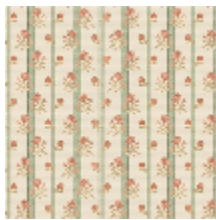
6497-02 MADemoiselle - PRINTEMPS