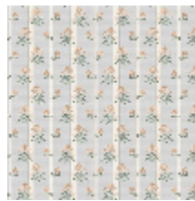
6497-04 MADemoiselle - BLEUET