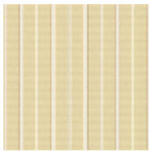
6498-01 RAYURE MLE - PAILLE