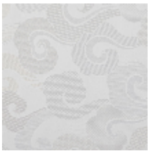
0651-01 ALIZE - ECUME