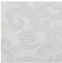
0651-01 ALIZE - ECUME