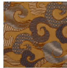
0651-05 ALIZE - AMBRE