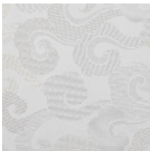
0651-01 ALIZE - ECUME