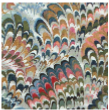
0654-01 DIVIN - CELADON