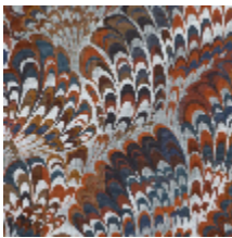
0654-02 DIVIN - INDIGO