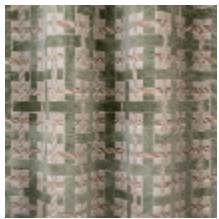
0655-01 LACIS - CELADON