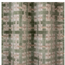
0655-01 LACIS - CELADON