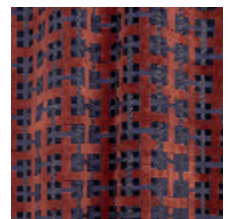
0655-06 LACIS - ACAJOU