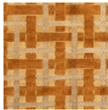
0655-04 LACIS - AMBRE