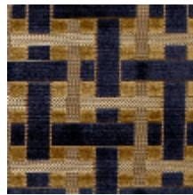
0655-05 LACIS - INDIGO