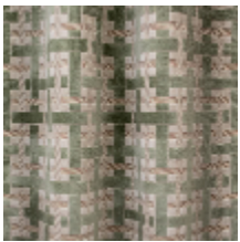
0655-01 LACIS - CELADON