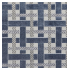
0655-02 LACIS - BLEUET