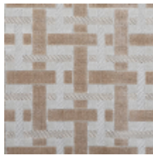
0655-03 LACIS - NATUREL