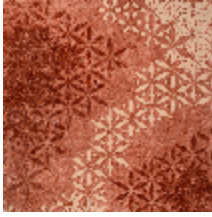
6588-02 TAPIS ECLATS TERRACOTTA