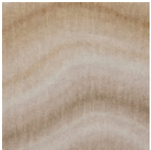
0733-01 CARRIERE MI - ONYX