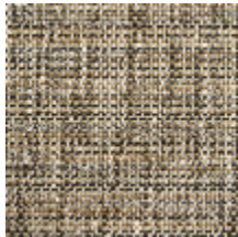
0746-01 MANGROVE MI - CAMEL