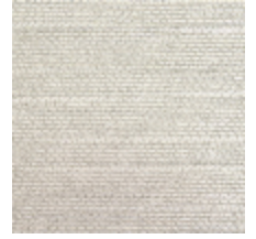
0750-06 COCOA MI - COCO