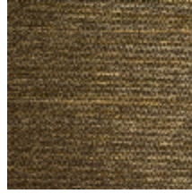
0750-04 COCOA MI - PALME