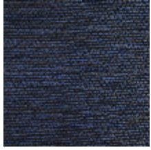
0750-01 COCOA MI - NUIT