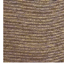
0750-05 COCOA MI - TIARE