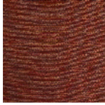
0750-03 COCOA MI - LAQUE