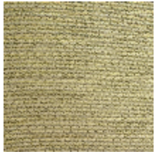
0750-07 COCOA MI - PEPITE