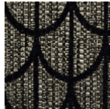
0754-05 PARURE M1 - PLUME