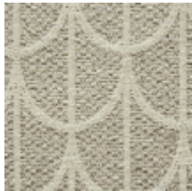
0754-01 PARURE M1 - CYGNE