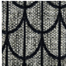
0754-03 PARURE M1 - HERON