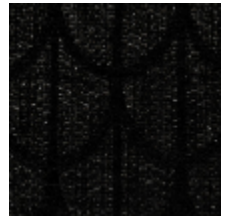
0754-06 PARURE M1 - EBENE