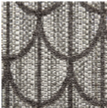
0754-02 PARURE M1 - CENDRE *