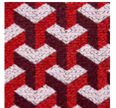
0755-10 CERAMIC M1 - GRENADINE *