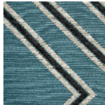
0760-06 CORRIDOR MI - PETROLE *