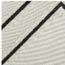
0760-03 CORRIDOR MI - CRAIE *