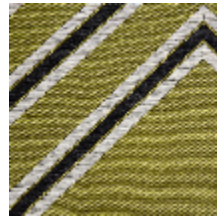
0760-07 CORRIDOR MI - MOUSSE *