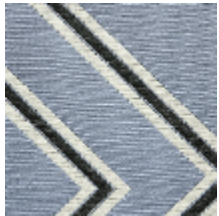
0760-02 CORRIDOR MI - LAVANDIN *