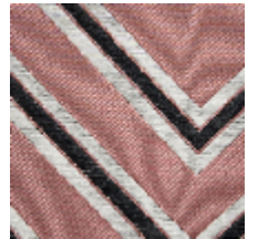
0760-09 CORRIDOR MI - CANDY *