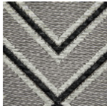
0760-04 CORRIDOR MI - GRAPHITE *