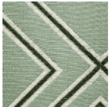
0760-01 CORRIDOR M1 - SAUGE *