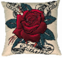
7612-01 COUSSIN MORPHING BENGALE