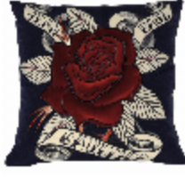
7612-03 COUSSIN MORPHING MARINE