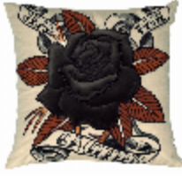
7612-02 COUSSIN MORPHING GOLD