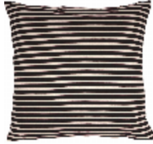
7624-03 COUSSIN MARINIÈRE NOIR/ECRU