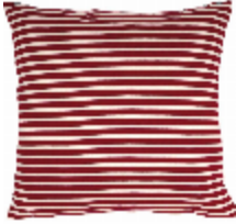
7624-02 COUSSIN MARINIÈRE ROUG/ECRU