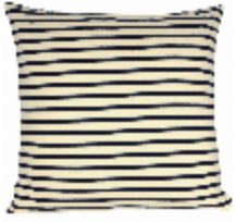
7624-01 COUSSIN MARINIÈRE ECRU/BLEU