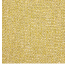
0798-03 TWEED - PEPITE