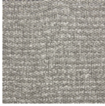
0798-02 TWEED - GRES