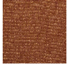
0798-06 TWEED - BRIQUE