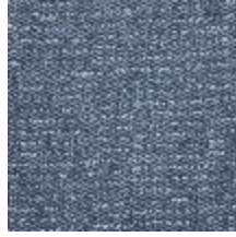
0798-04 TWEED - OCEAN