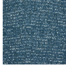
0798-05 TWEED - CANARD