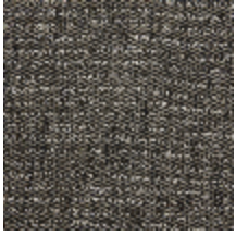
0798-01 TWEED - POIVRE