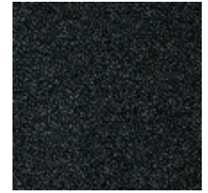
0802-12 LAGO M1 - CHARBON