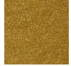
0802-06 LAGO M1 - CURCUMA