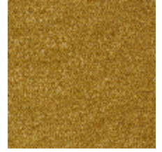
0802-06 LAGO M1 - CURCUMA