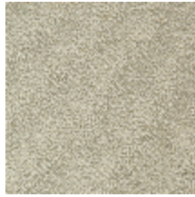
0802-09 LAGO M1 - CHANVRE