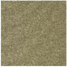
0802-07 LAGO M1 - LIN