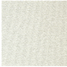
0802-08 LAGO M1 - NEIGE