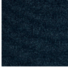
0802-02 LAGO M1 - NUIT