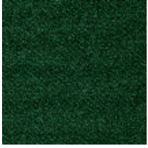
0802-01 LAGO M1 - CANARD