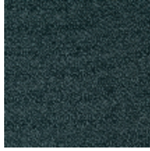
0802-03 LAGO M1 - AZUR