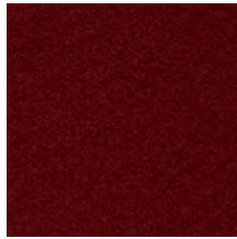
0802-15 LAGO M1 - GRIOTTE