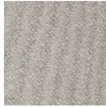
0802-10 LAGO M1 - TOURTERELLE