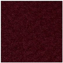
0802-13 LAGO M1 - BORDEAUX