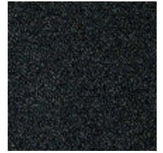
0802-12 LAGO M1 - CHARBON