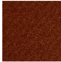
0802-16 LAGO M1 - SANGUINE