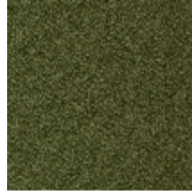
0802-04 LAGO M1 - AMANDE