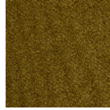
0802-05 LAGO M1 - MOUTARDE