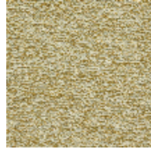
0803-05 PIAZZA - NOUGAT