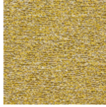
0803-04 PIAZZA - MAIS