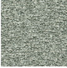
0803-02 PIAZZA - BRUME