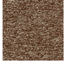
0803-06 PIAZZA - TOMETTE