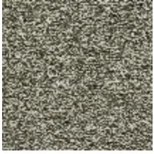
0803-01 PIAZZA - PEPPER