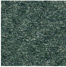
0803-08 PIAZZA - ARCTIQUE