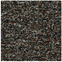
0803-07 PIAZZA - ABYSSE