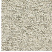
0803-03 PIAZZA - NATUREL