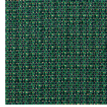
0804-05 DONNA MI - EMERAUDE