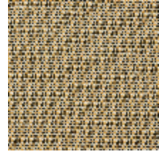
0804-06 DONNA MI - SIENNE