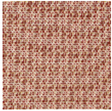
0804-07 DONNA MI - TOMETTE