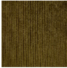
0806-08 RIGA M1 - KAKI