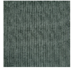
0806-12 RIGA M1 - ARDOISE