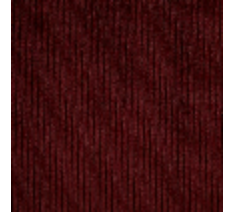
0806-06 RIGA M1 - BORDEAUX