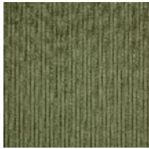
0806-14 RIGA M1 - SAUGE