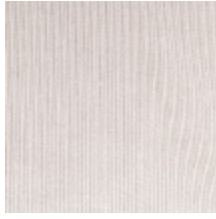
0806-26 RIGA M1 - KRAFT