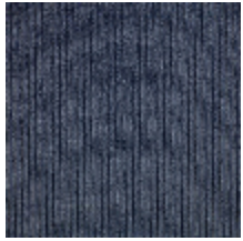
0806-07 RIGA M1 - IRIS