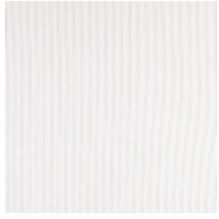
0806-25 RIGA M1 - CRAIE