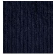
0806-17 RIGA M1 - MARINE