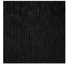
0806-18 RIGA M1 - NOIR