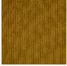
0806-01 RIGA M1 - CURRY