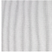
0806-27 RIGA M1 - BRUME