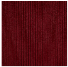
0806-13 RIGA M1 - THEATRE