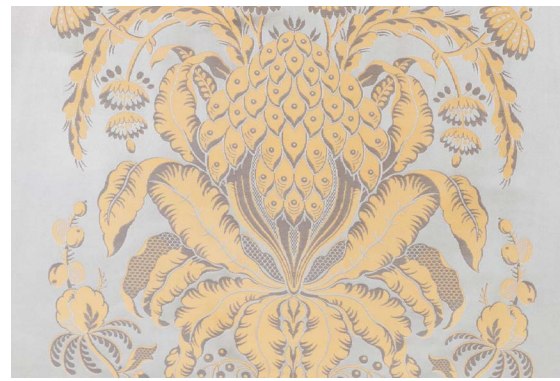
(a) Les Ananas, col. Opal