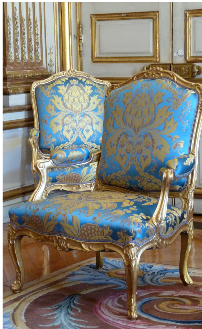
Salon Pompadour, Palais de l'Élysée