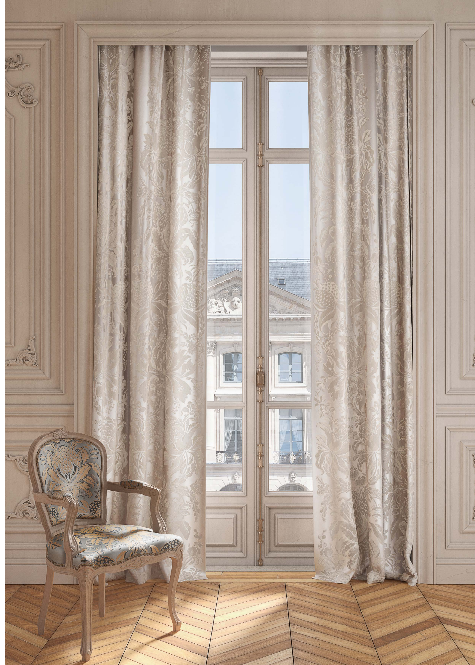
(c) Les Ananas, col. Opal (chair) col. Nacre (curtains)

Another specific quality of the newest releases is their width — 130 cm vs 54 cm for earlier colourways — with a two-row full drop pattern repeat. Wider rolls ensure the fabric can be used on larger surfaces, as the fabric's natural and opulent drape makes it a perfect choice for window coverings. It is also ideally suited for wall and seat upholstery. This soft and supple all-silk lampas is woven at our factory near Lyon, France.