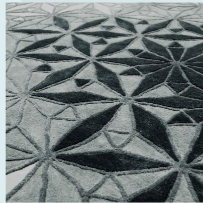
01 - ARDOISE